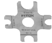
Multiple Sizes Series